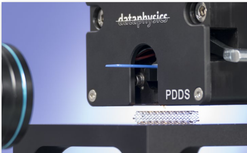
Fig. 1: picolitre dosing system PDDS

The surface energies of a tinned and a pure copper wire have been determined measuring contact angles with various liquids using the optical contact angle measuring and contour analysis system OCA 200 in combination with the picolitre dosing system PDDS. With this system it is possible to determine the surface energy directly on the thin wires, which are just a few 100 \mu\text{m} in diameter, since optimizing the shape and minimizing the volume of the picolitre drops allows to reliably measure contact angles even on smallest surfaces.