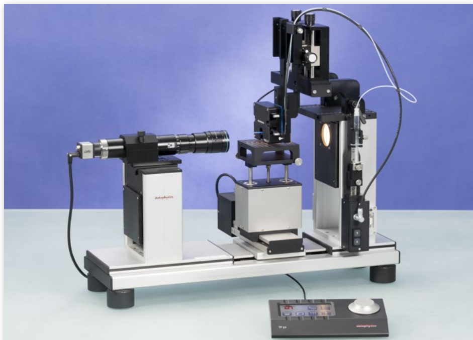
Fig. 2: DataPhysics Instruments optical contact angle measuring and contour analysis system OCA

Thus, in the application note at hand we demonstrate how to proceed to generate optimal, reliable drops with the PDDS as we present the determination of the surface energy of two copper wires.