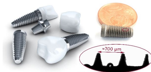
Fig. 1. Droplet between the screw threads of a dental implant.

The surface treatment of dental implants has attracted increasing attention due to its important utilisation in the optimisation of the implants wetting behavior. Studies have shown that the initial attachment of osteoblasts is improved by increasing the surface energy, which subsequently leads to increased new bone formation after implantation. Thus, various surface treatment devices have appeared and the plasma handheld device piezobrush® PZ3 is widely used in dental laboratories. The surface energy is a vital parameter to verify a successful pretreatment or cleaning process of the implant surface. Furthermore, the knowledge of the surface energy facilitates an estimation of the wetting behaviour and adhesive properties of the implants for further processing. However, the surface energy analysis of micro-structured samples (Fig. 1) is still a big challenge, because the available test areas are very small and a reliable analysis requires small enough droplets that don't touch or wet beyond the edge of the test surface. To meet this issue, DataPhysics Instruments developed the picolitre dosing system (PDDS) for dosing extra-small droplets (down to 30 pl). In combination with the contact angle measuring system OCA 200, a fast and reliable surface energy analysis of implants is guaranteed.