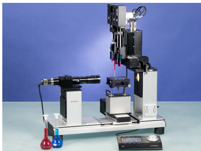
Fig. 2. The optical contact angle measuring and contour analysis systems OCA 200, DataPhysics Instruments.

In combination with the picolitre dosing system PDDS (Fig. 3), contact angle measurement on the smallest structures becomes feasible, such as the mesh structure of a coronary stent or on single fibres.