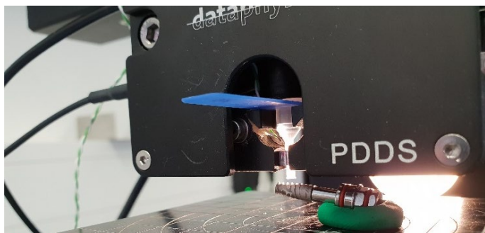
Fig. 3. Picolitre dosing system PDDS

The surface energies for untreated and plasma treated implants were determined indirectly via contact angle measurements by using two test liquids with known properties. Water and diiodomethane were chosen in this note.