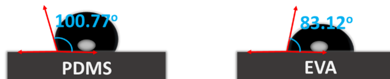
Figure 1. Water contact angle measurement on PDMS and EVA.

Amongst the key parameters for a good material in the field of microfluidic applications is their wettability. Previous works showed that materials with a highly hydrophobic character such as PDMS lead to a slower fluid flow and increased risk of channel blocking. To clearly understand the wetting behaviour of EVA, contact angle (CA) measurements on PDMS and EVA were conducted. As Figure 1 illustrates, EVA has a much smaller CA compare to PDMS, indicating that EVA is less hydrophobic and more wettable than PDMS. This leads the effect that the EVA microfluidic chips can work faster and are very seldomly blocked.