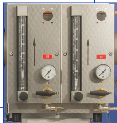
gas supply system