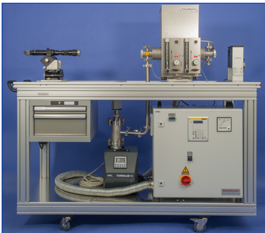
OCA 25-HTV 1800 with optional trolley cart

Video-based contact angle measuring and contour analysis system for high temperatures and vacuum