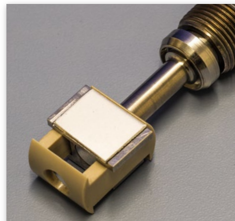
magnetic positioning system for solids